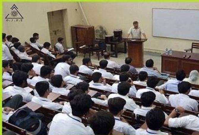
Dr. Pervez Hoodbhoy lecturing students on Critical Thinking, Rationality and Science