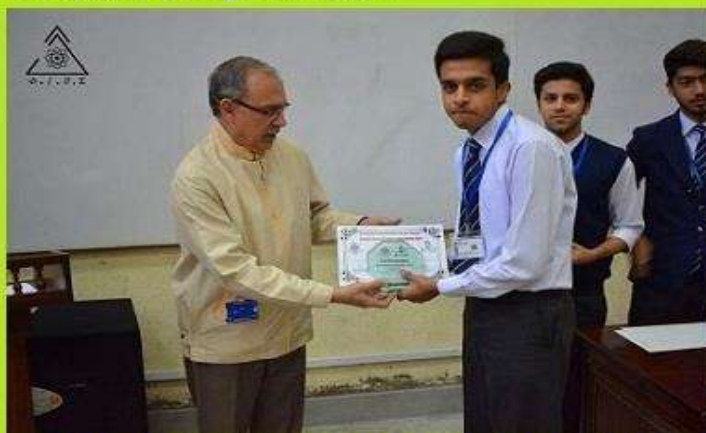
Vice Rector (I) presenting position holders of FIPS Science Essay Writing Competition, 2018 with shields and certificates

In October, FIPS also organized a Science Essay Writing Competition . The topics provided to students in this competition for essay writing included 'The Big Bang Theory', 'Human Colonization of Mars' and 'Earthquakes and Volcanoes'. A large number of students participated in the competition. An Appreciation Ceremony was held to present the participants with participation certificates and the position holders with shield and souvenirs. The certificates were awarded to the participants by the honorable Vice Rector (I) and Head of Physics Department.