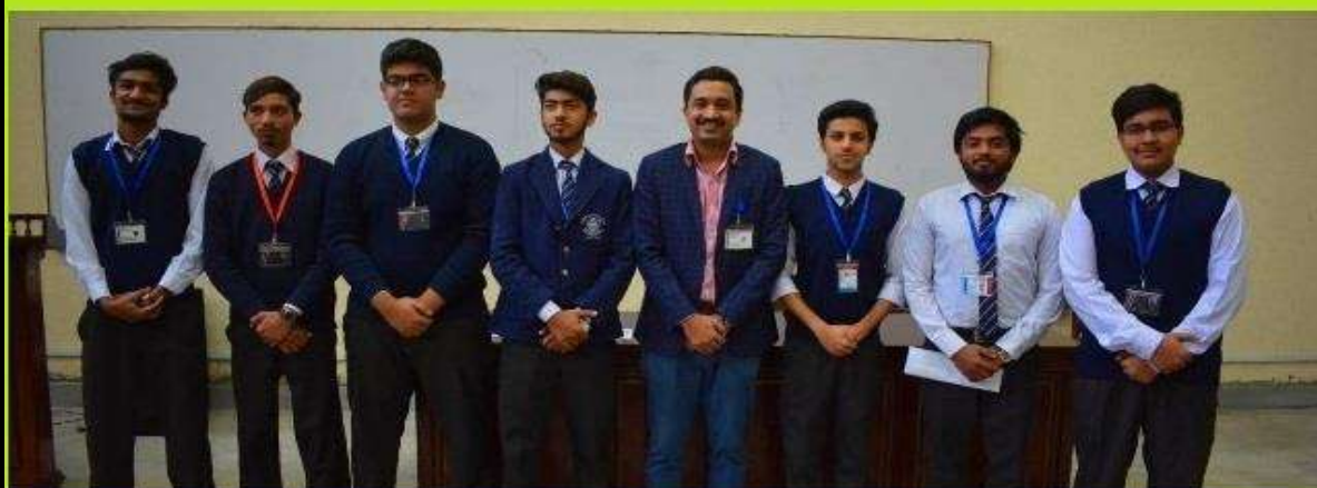
The Student body of FIPS posing for a group photo with the Advisor