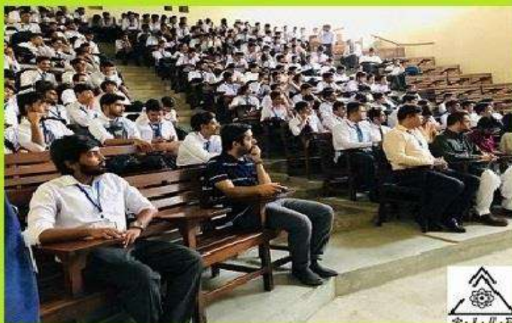
Audience at the Documentary Screening Event, "Alien Invasion"