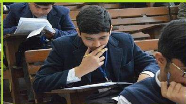
Students attempting the very challenging FIPS Nerd Quiz, 2019

In February, FIPS organized the fourth edition of FIPS Nerd Quiz Competition. The quiz contained challenging objective type questions of General Science from the categories of Physics, Chemistry, Biology, Astronomy and Computer Science. A large number of students from different disciplines participated in the competition. Position holders and participants were appreciated in a ceremony.