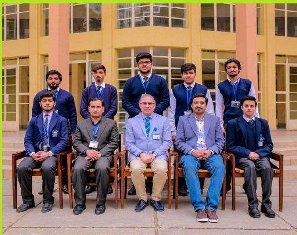
Annual Photograph Formanites Intermediate Physics Society 2018-2019