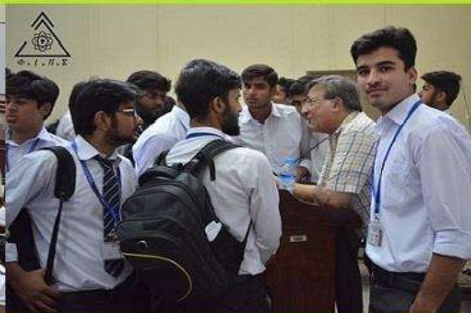
Students excitedly crowding around Dr. Hoodbhoy with their questions afterwards

In October, FIPS arranged an interactive session on ' Critical Thinking – Rationality – Science ' which was conducted by renowned nuclear scientist, analyst, activist and social critic, Dr. Pervez Hoodbhoy , who is currently a Professor of Physics at Forman Christian College (A Chartered University). This highly informative, knowledgeable and thought-provoking session was followed by a long, interactive question answer session. The event was attended and enjoyed by a large number of students and respected faculty members from different disciplines.