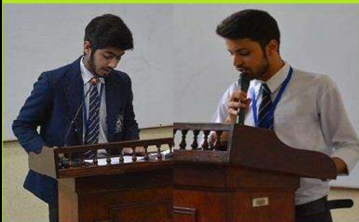
President and Vice President of FIPS informing the audience about the progress of the society