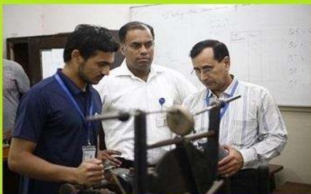
Faculty and staff listing and separating equipment for the museum