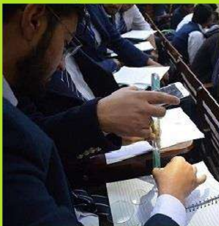
Workshop participants engaged in analysing lens for making their telescopes with the trainer's help