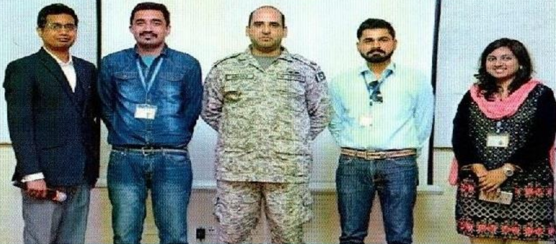
Uraan Career Prep Fellowship Workshop